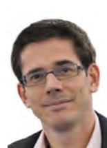
Bas Eickhout, MEP