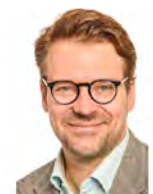
Ville Niinistö, MEP