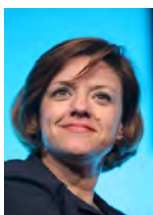
Monica Frassoni President